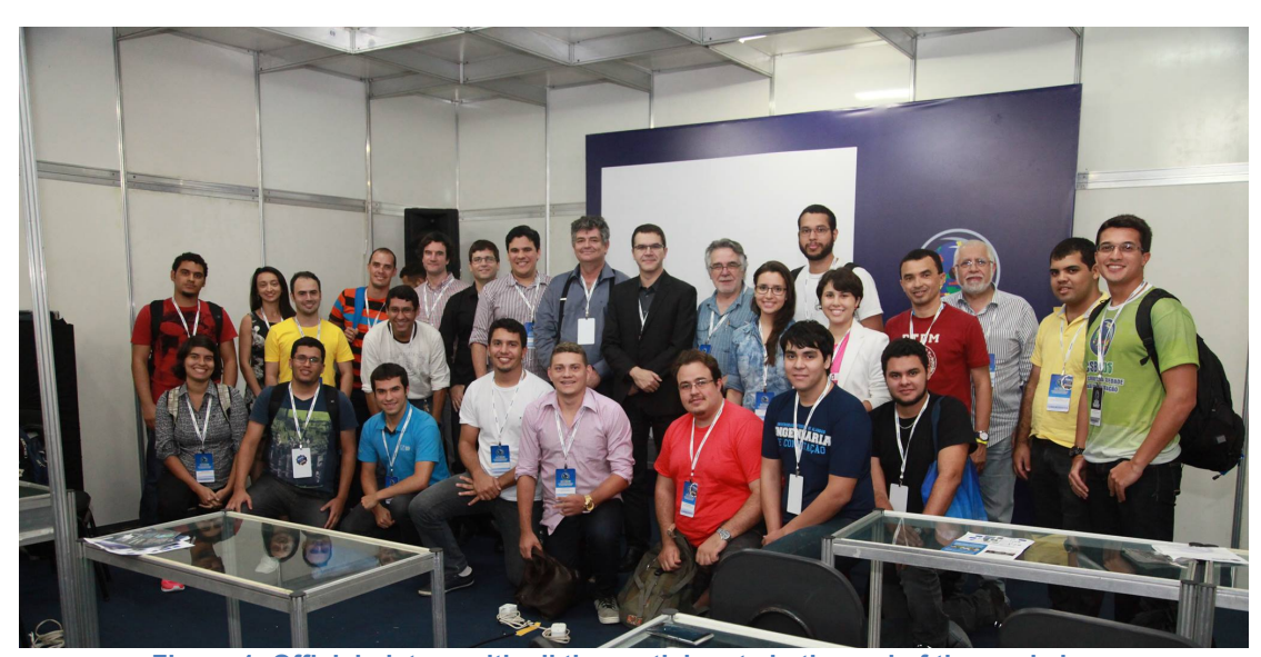
Figure 1: Official picture with all the participants in the end of the workshop.

In the next sections, it is presented a summary of the three main activities aforementioned.